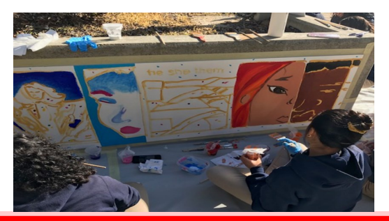
Analy and America