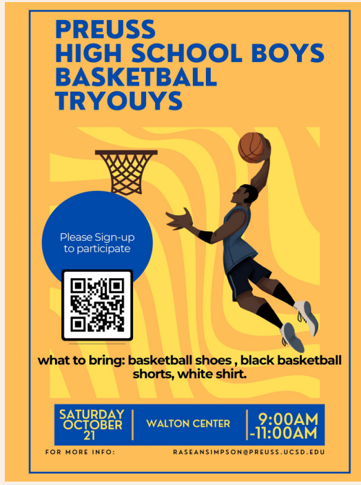
CLICK THE FLYER TO SIGN UP!

Put these important numbers in your phone so you have them available anytime you ride the trolley.