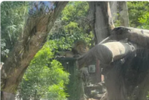
AP Biology Ventures Into San Diego Safari Park