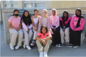
Preuss Spirit Expressed In A Week

A newspaper made by students, for students of the Preuss School UC San Diego