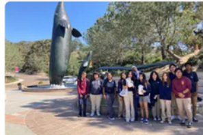
Preuss Marine Biologists Explore Birch Aquarium