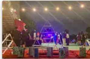
Preuss Presents its 2023 Fall Formal