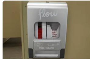
New Period Product Dispensers Installed In All Girl Bathrooms