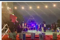
Preuss Presents its 2023 Fall Formal