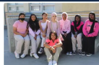
Preuss Spirit Expressed In A Week

A newspaper made by students, for students of the Preuss School UC San Diego