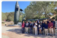
Preuss Marine Biologists Explore Birch Aquarium