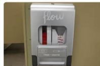
New Period Product Dispensers Installed In All Girl Bathrooms