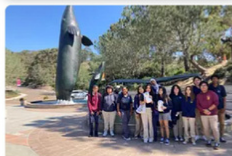
Preuss Marine Biologists Explore Birch Aquarium