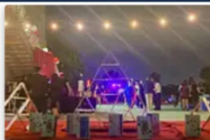
Preuss Presents its 2023 Fall Formal