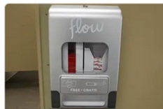
New Period Product Dispensers Installed In All Girl Bathrooms