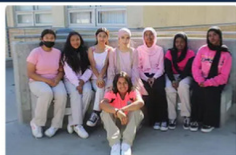
Preuss Spirit Expressed In A Week

A newspaper made by students, for students of the Preuss School UC San Diego