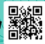
Teachers Pre-Sale Code