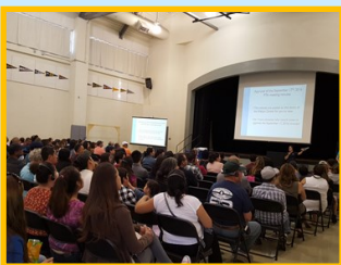
Presentation at the PTA meeting on October

I am happy and thankful to be a part of The Preuss School and look forward to working with Preuss School families as we step towards a healthier future. I am pleased and eager to hear any feedback from parents and students throughout this journey.