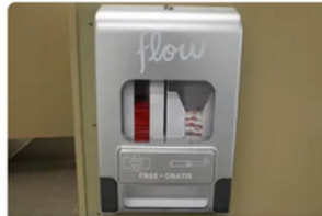
New Period Product Dispensers Installed In All Girl Bathrooms