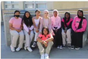
Preuss Spirit Expressed In A Week

A newspaper made by students, for students of the Preuss School UC San Diego