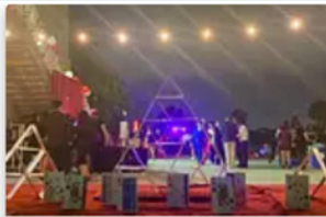
Preuss Presents its 2023 Fall Formal