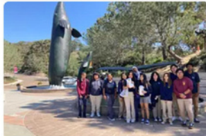
Preuss Marine Biologists Explore Birch Aquarium