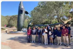
Preuss Marine Biologists Explore Birch Aquarium