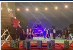
Preuss Presents its 2023 Fall Formal