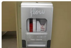
New Period Product Dispensers Installed In All Girl Bathrooms