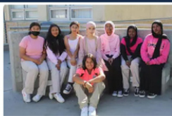
Preuss Spirit Expressed In A Week

A newspaper made by students, for students of the Preuss School UC San Diego