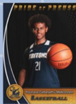
PRIDE OF PREUSS [Student Name] BASKETBALL