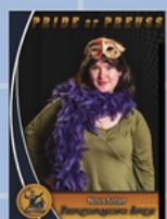
PRIDE OF PREUSS [Student Name] [Activity]