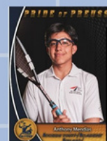
PRIDE OF PREUSS [Student Name] [Activity]