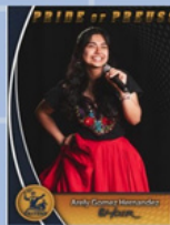
PRIDE OF PREUSS [Student Name] [Activity]