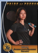
PRIDE OF PREUSS [Student Name] [Sport]