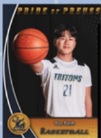
PRIDE OF PREUSS [Student Name] BASKETBALL