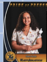
PRIDE OF PREUSS [Student Name] [Activity]