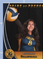
PRIDE OF PREUSS [Student Name] VOLLEYBALL